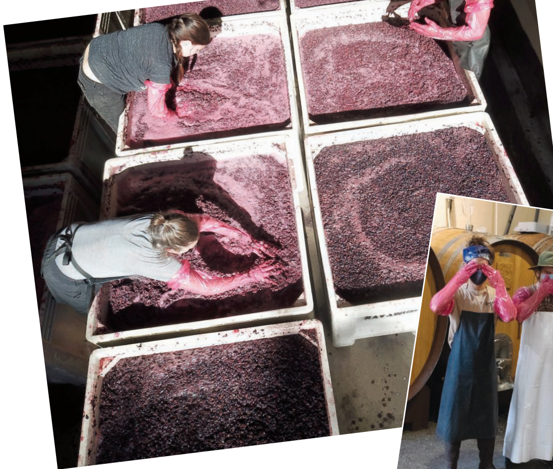
Pigeage à la Navarro

Navarro winery crush interns ready for punchdowns, September 2020. In spite of masks, social distancing, smoke and ash—not to mention the lack of a sit-down hot meal at noon—it was one of the best teams we've seen at Navarro.