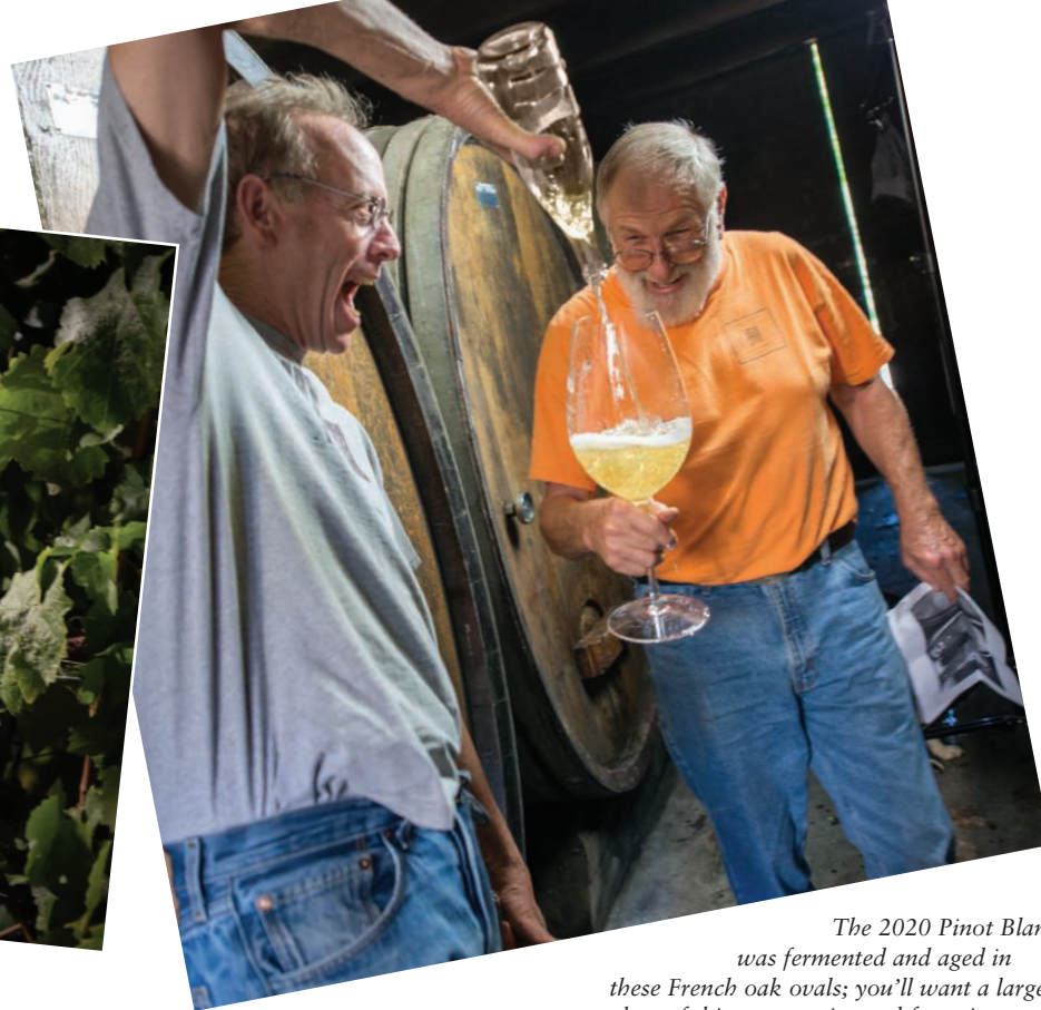
The 2020 Pinot Blanc was fermented and aged in these French oak ovals; you'll want a large glass of this sunny, crisp and fun wine.